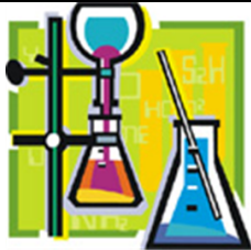
Logical-Mathematical Intelligence or Logic Smart

In the workplace, people who require musical intelligence include: piano tuners, studio directors, music performers, conductors, and sound engineers.